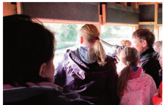
Observing from the River hide

Light snacks & more substantial meals available by pre-ordering