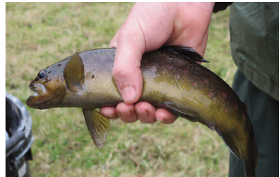
Wild Brown Trout.