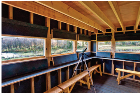
River observation hide