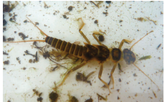
Stonefly Lava - under microscope

Plenty of room for activities within the Field Centre and hides. Wellies and ponchos available.